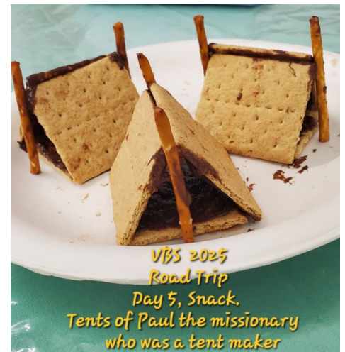
VBS 2025 Road Trip Day 5, Snack. Tents of Paul the missionary who was a tent maker