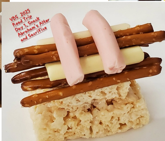
VBS 2025 Road Trip Day 1, Snack Abraham's Altar and Sacrifice