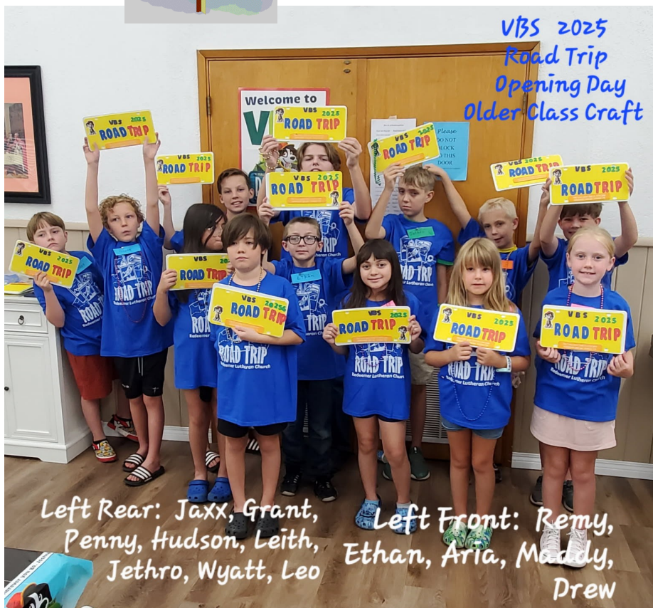
VBS 2025 Road Trip Opening Day Older Class Craft