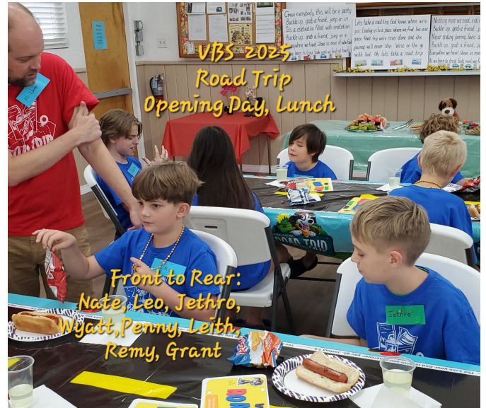
VBS 2025 Road Trip Opening Day, Lunch