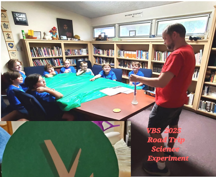
VBS 2025 Road Trip Science Experiment